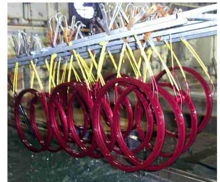
Red anodized rings entering the rinse tank.

Students participating in this event will have their conference fees waived. Authors of selected work may apply for reimbursement of their travel expenses by the Council.